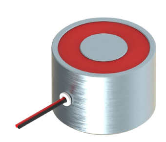
Protection rate: IP65 Insulation class: Y (90°C) Standard voltage: 24VDĆ Standard duty cycle: See chart Different voltage, ED or size: Consult

When working with suspended loads, security norms must be respected.